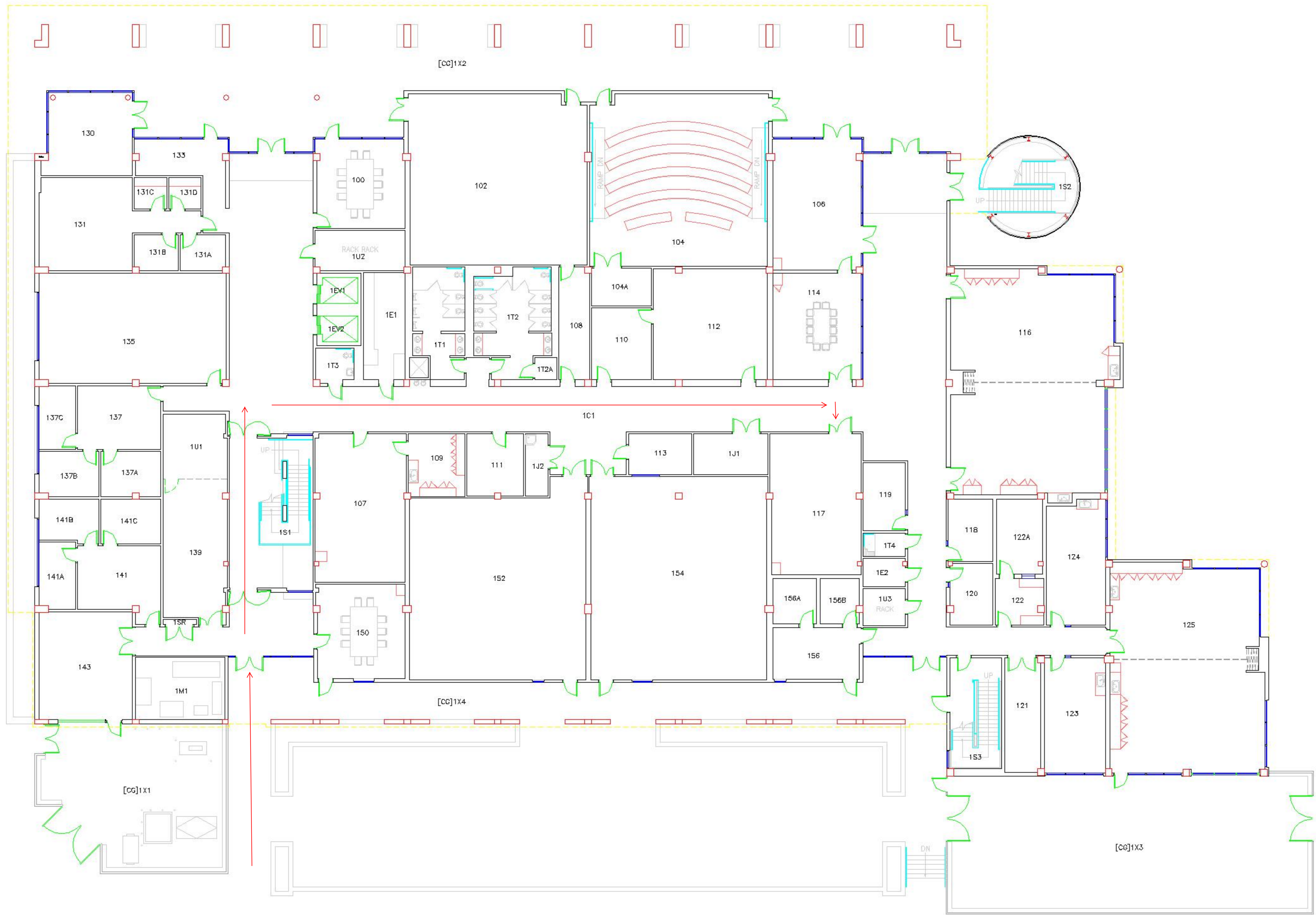
Addendum No. 1 Attachment 2A